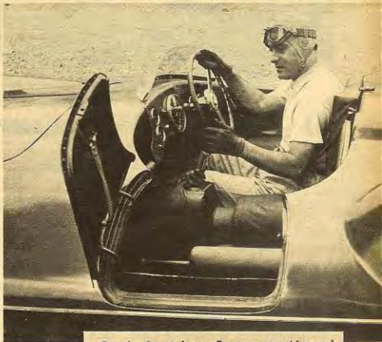
Consalvo Sanesi, famous European race driver and chief test driver for the Alfa Romeo firm, race-tested the new car at the Monza circuit in Italy.

Top speed of the Alfa "Disco Volante" is about 160 mph. Total weight of car is only 1650 lbs.